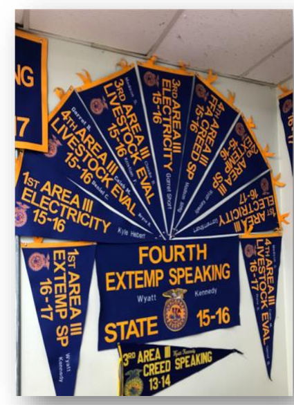
"My biggest concern is making sure students are successful. I want to make sure they are proud of their program and this is best achieved by hanging up banners. But achieving this is my biggest concern." – Participant #9, Photo Caption

Photos and captions from Participant #9, #21, and #29