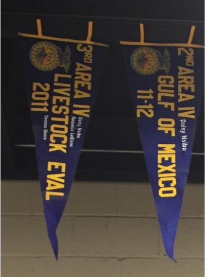
"This picture represents my concern because I am worried that I might not be competitive enough for this job. I see a lot of banners hanging on the walls of ag buildings but I am just not that competitive" – Participant #29, Photo Caption

As the students began to come to terms with feelings of incompetence regarding their lack of technical knowledge, their tensions reemerged after viewing photographs (see Figure 2) submitted by their peers that depicted success in agricultural education. As an illustration, many of the participants