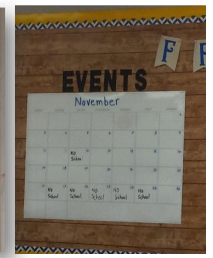
One of my big concerns is just how busy ag teachers are. It seems like their schedules are crazy. – Participant #30, Photo Caption