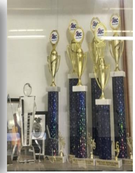
"My biggest concern is I want them [my students] to feel the success of winning their desired contest. But I am worried that all of hard work and commitment it takes to win will make me burned out." – Participant #21, Photo Caption